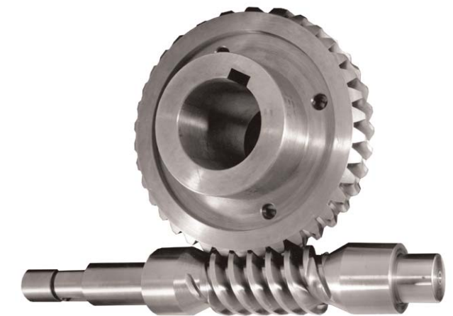
New Replacement Worm Gear Sets for Montgomery Escalator Machines.