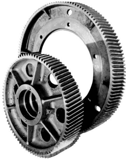
New Replacement Escalator Gears for Otis #17VEG Machine. Three Gears shown.